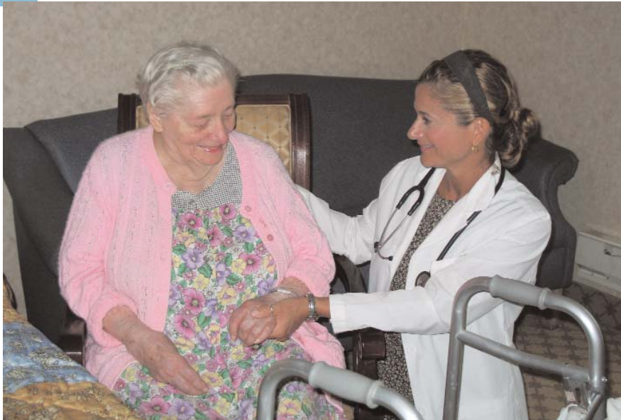
NP Care takes its nurse practitioners through a three-week course on clinical geriatric care, in particular, in the nursing facility setting.

services to reduce duplication, fragmentation, and delays inherent in the existing approach.